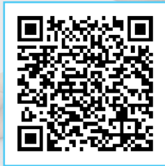
JEB Little Creek