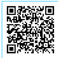
Norfolk Naval Shipyard