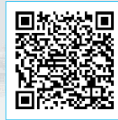
Naval Station Norfolk